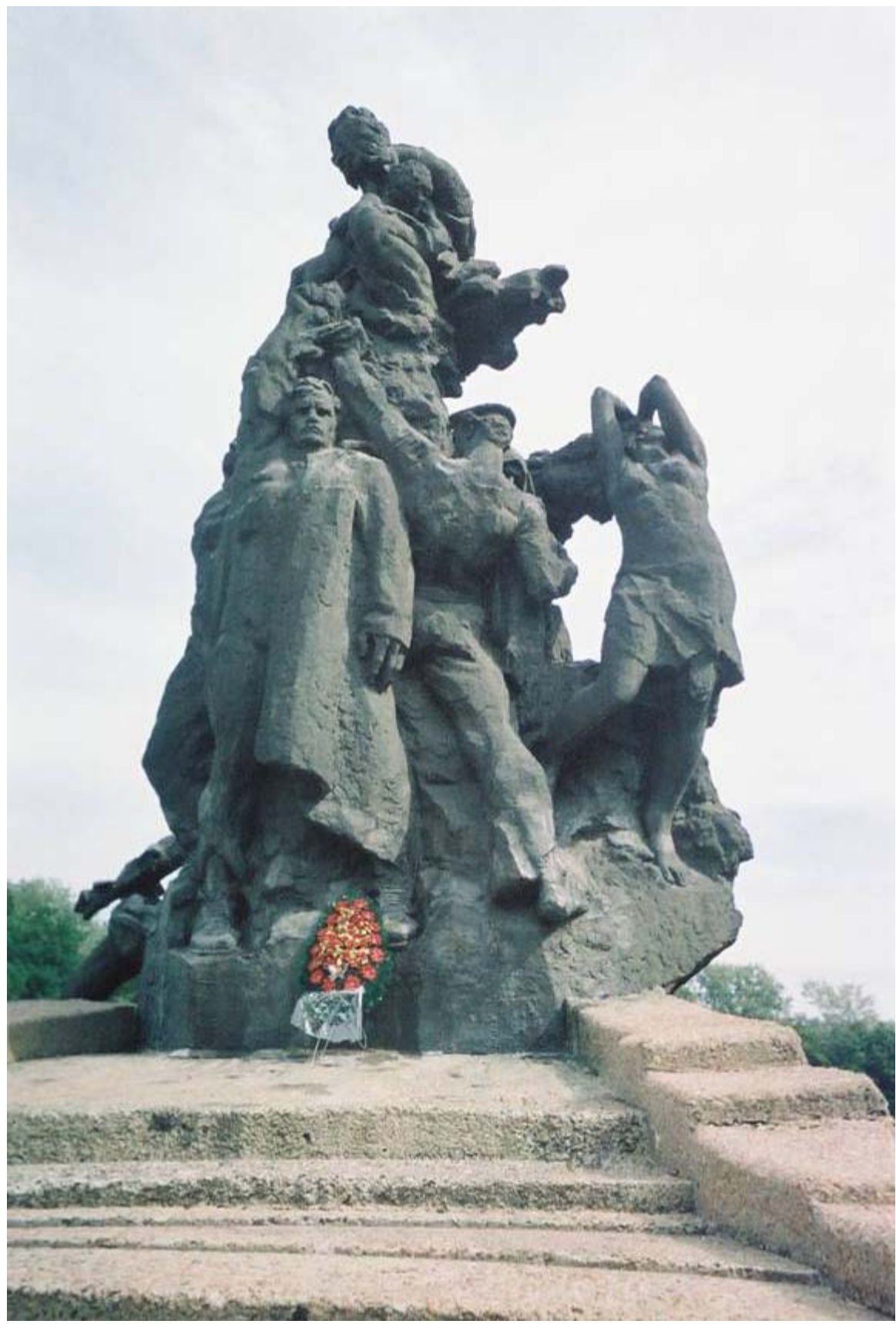
Soviet Babi Yar Memorial