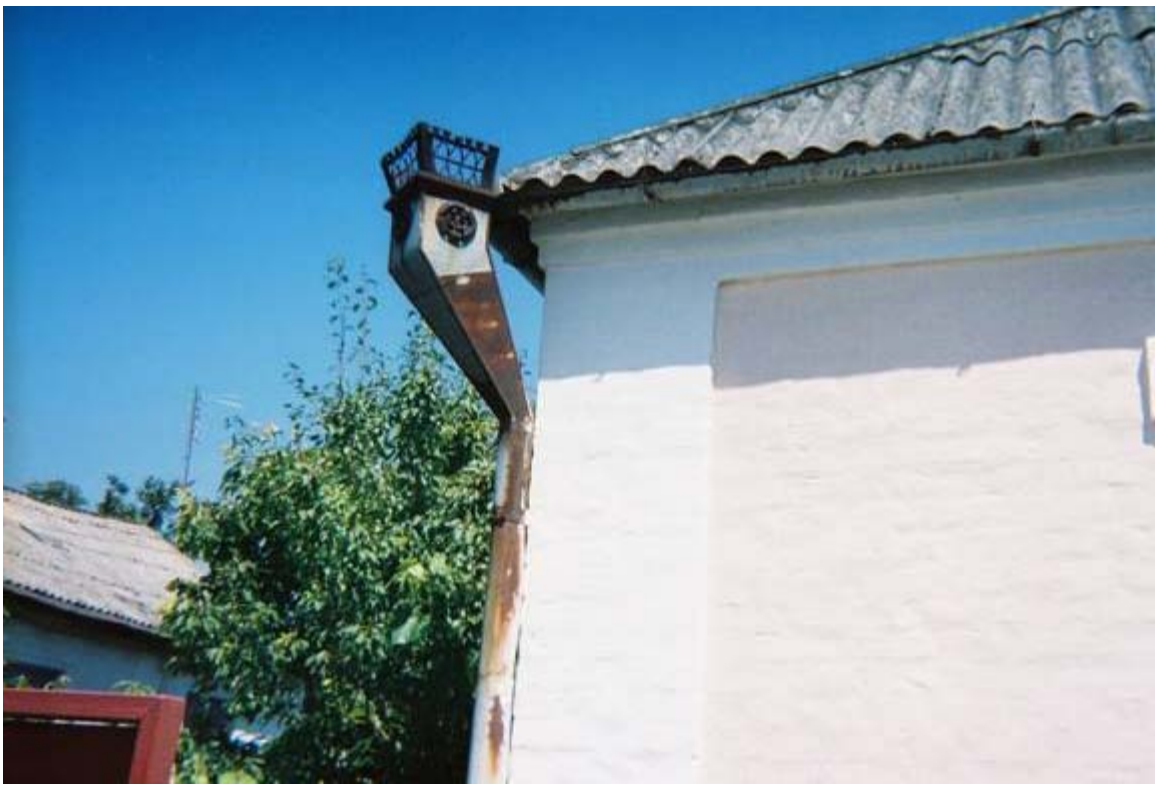
Tarshcha pretty drainspout