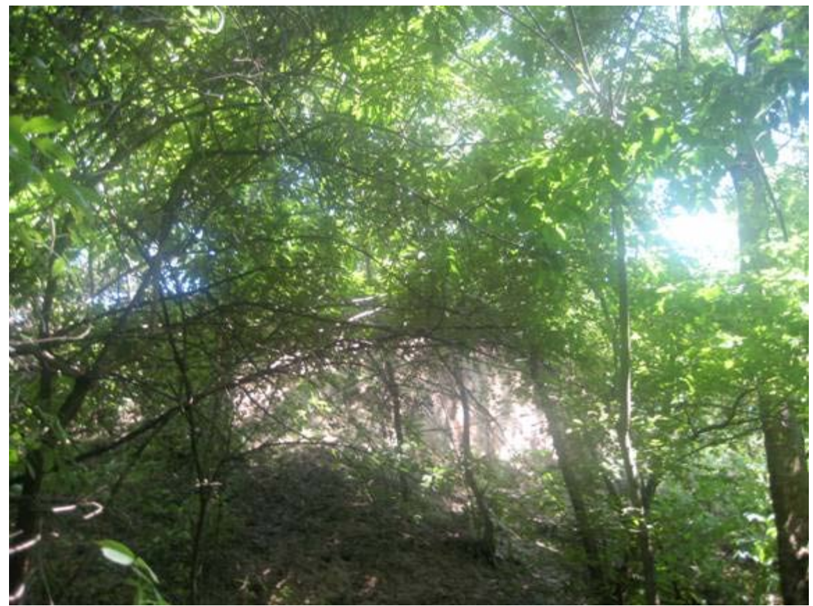
Looking up to the top of the ravine

I looked up to the top of the ravine and said, "This is where my grandfather would have died."