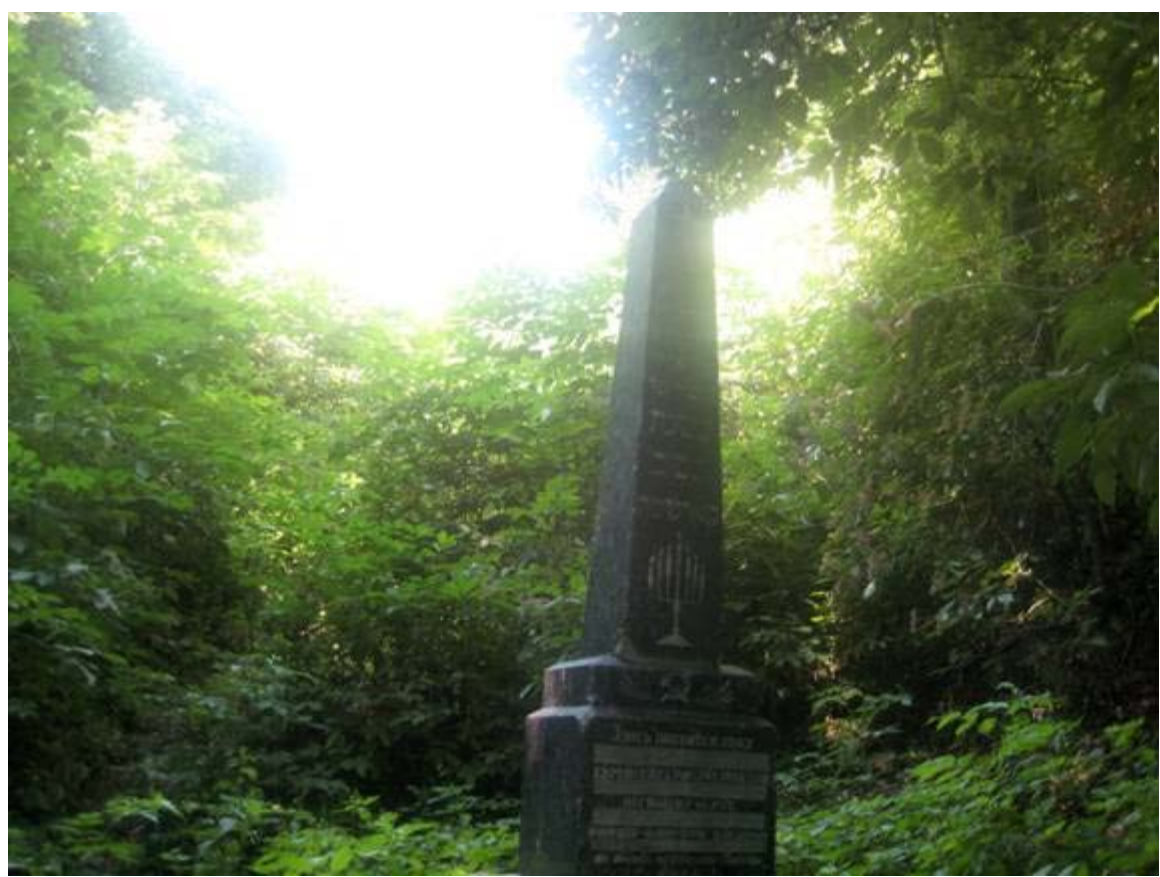
Tarashcha Babi Yar Mass Grave Marker, Hebrew, Russian and the Hammer and Sickle

The place was so deep in the woods, you might live your whole life in that town and never know it was there. And it was beautiful...as are so many such sites, I've read. The guide said that, with the help of the Ukrainian police, the Nazis led the Jews up to the ledge some forty feet above us and shot them into this pit, some 1000 in all.