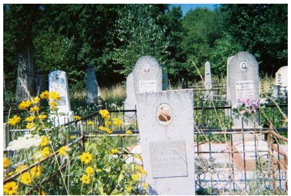
Soviet-era Jewish graves