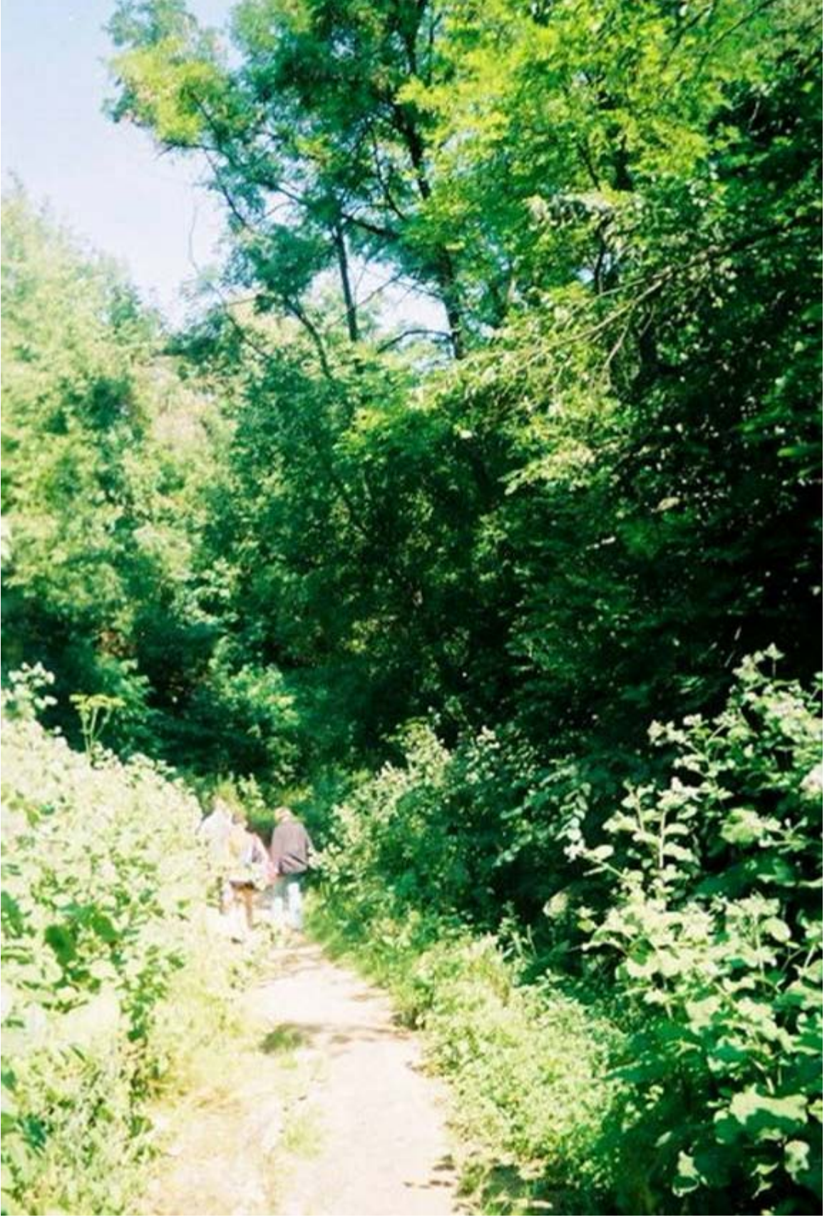
And deeper into the woods

It was beautiful and the woods grew more and more overgrown. Then we turned left and there, in a shaded grotto, was something I did not expect: a black obelisk memorial, in Hebrew and Russian, with the hammer and sickle, so it was pre-independence.