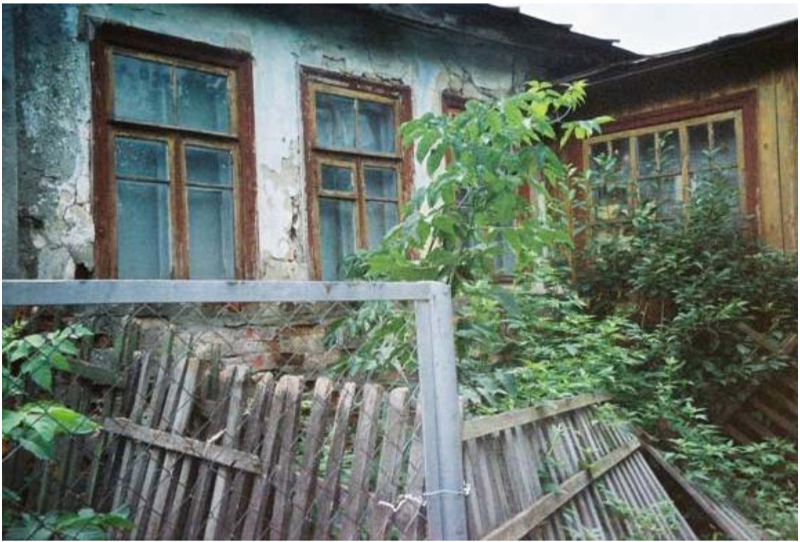
The house of the last Jew in Tarashcha

And yet this drainspout bespeaks a more prosperous time and an artistic sensibility that could make even the most utilitarian items beautiful.