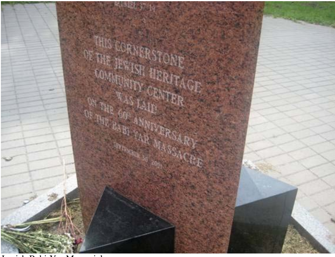
Jewish Babi Yar Memorial

It is clear that independence has wrought great changes in the Ukraine. People pointedly speak Ukrainian, not Russian. The statue celebrating Ukrainian independence is a marked counterpoint to the Soviet-era statue of the Ukraine with her sword. And the Ukrane has imported so much of American culture: McDonalds, Coca Cola, Reebok...and cars. But it seems that they don't make the connection between abandoning mass transit in favor of cars and the noise, pollution and inconvenience of snarled traffic.