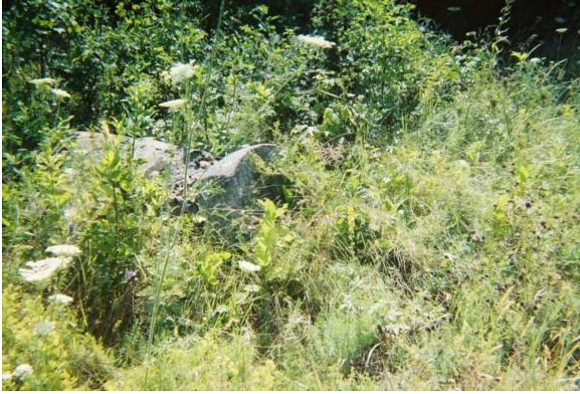
Older Jewish graves

The guide told us that the asphalt path down which we walked had been made for an Israeli delegation that came 10 years ago. I would be grateful to anyone who can help me identify any of these Israelis, the help would be greatly appreciated. The guide also said that there were underground tunnels that the Jews used to get to the river and escape but we couldn't go down into them, as they were unsafe now. Does anyone know of anything like this?