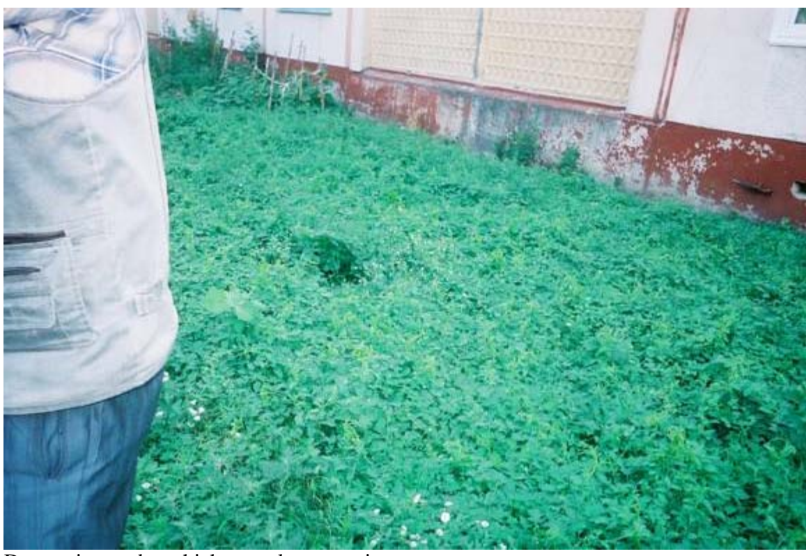
Depression under which tunnels may exist

The guide told us that the asphalt path down which we walked had been made for an Israeli delegation that came 10 years ago. I would be grateful to anyone who can help me identify any of these Israelis, the help would be greatly appreciated. The guide also said that there were underground tunnels that the Jews used to get to the river and escape but we couldn't go down into them, as they were unsafe now. Does anyone know of anything like this?