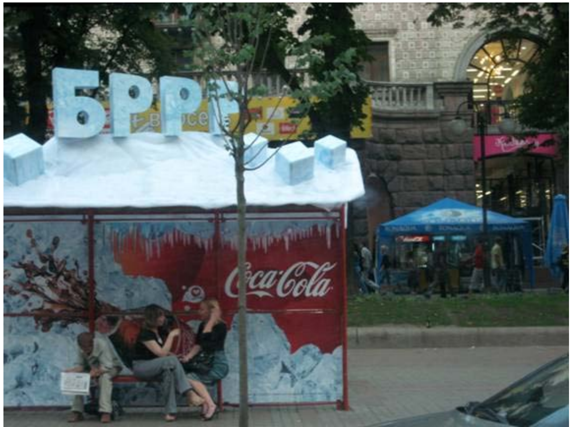
Coca-Cola bus station. (It says, "Brrr" on top.)

One thing struck me quite forcibly: I could pass for a Ukrainian. Just about everyone, it seemed, had green eyes and light brown hair. My daughter, on the other hand, has dark hair and deep brown eyes. It made me realize that it would be easy to pick someone like her out of a lineup as Jewish while I might be able to slip through the net.