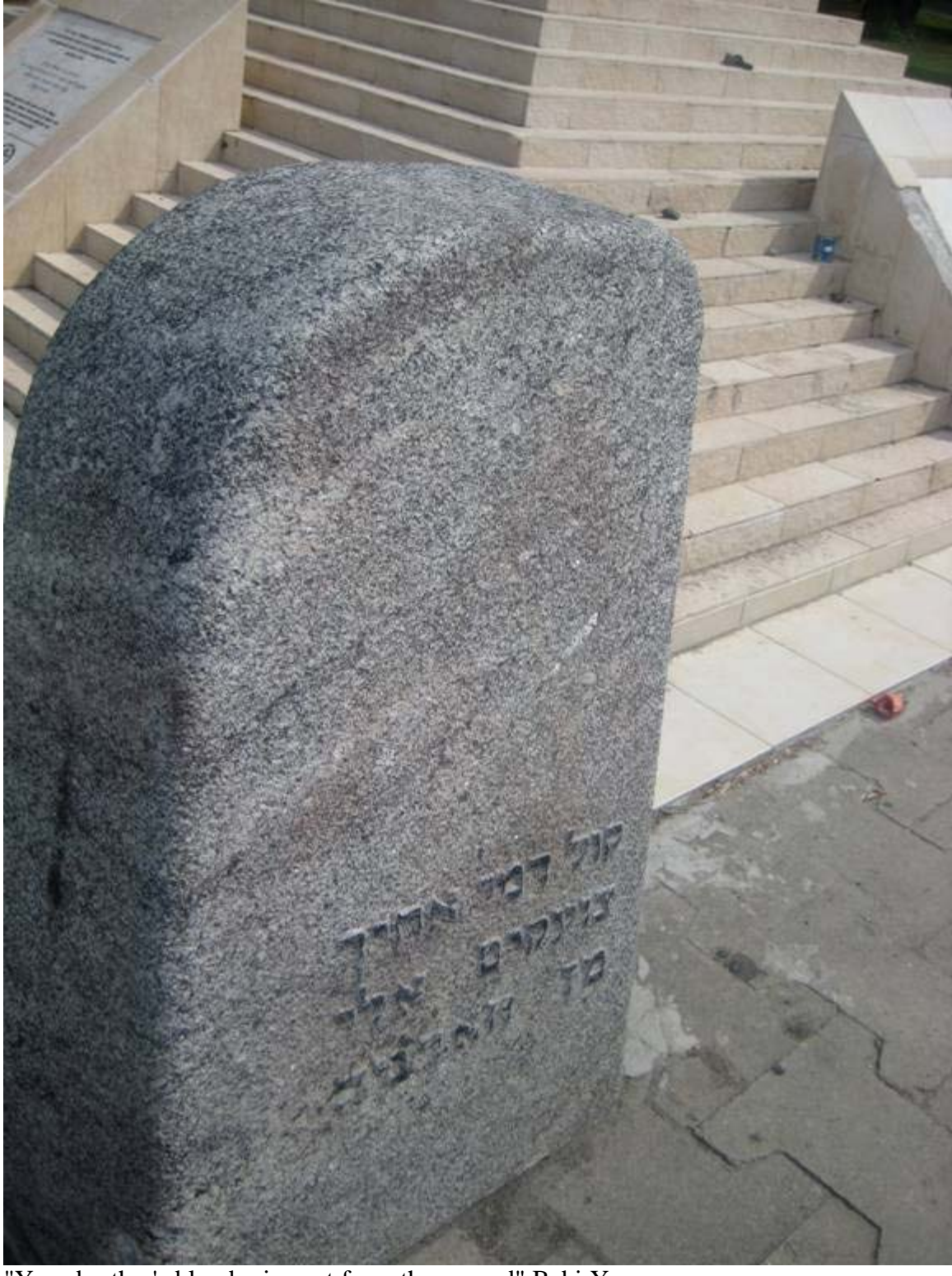
"Your brother's blood cries out from the ground" Babi Yar